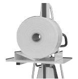
Art. no E-VB Size 400x400 mm Height 80 mm