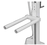
Art. no E-DS Diameter \varnothing 47 mm Width 450 mm CC distance 200 mm