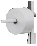
Art. no M-SS Diameter Ø 47 mm Length 600 mm