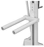
Art.no M-DS Diameter Ø 47 mm Length 450 mm CC distance 200 mm