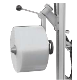
Art. no E-RR Roll inner dia. \varnothing 74-80 mm Roll outer dia. \varnothing 500 mm Roll width 250 mm