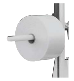
Art. no E-SS Diameter \varnothing 47 mm Width 600 mm