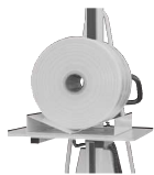
Art. no E-VB Size 400x400 mm Height 80 mm